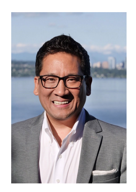
Who we are: Tadashi and Evergreen Certified