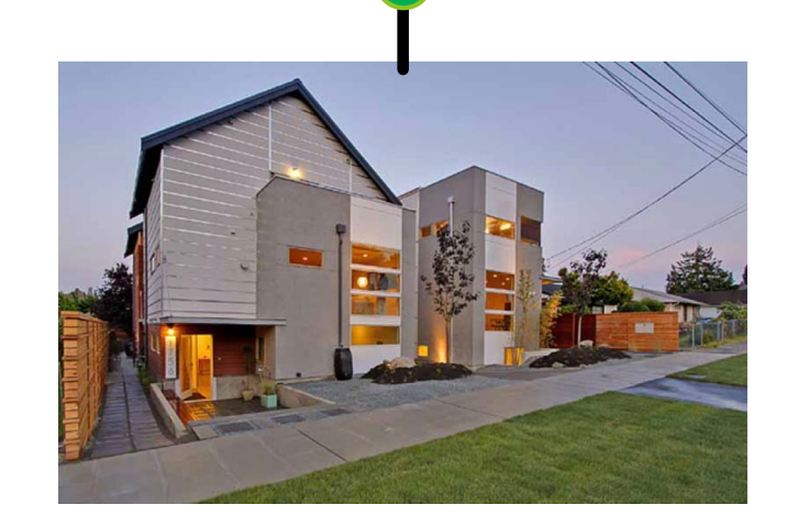
2009 - Judkins Park